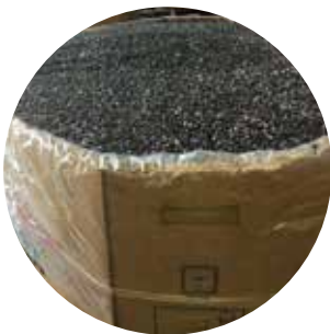
Bin & Drum Liners

High performance bag and cover solutions that ensure your waste management and containment needs are met on even the messiest of jobs.