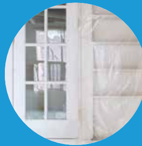
High Clarity Sheeting