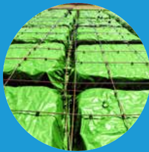
VaporPro™ Vapor Barrier