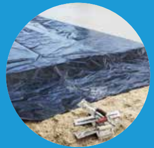
EcoPro™ Certified PCR Sheeting