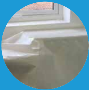
Flame Retardant Sheeting

Our high quality plastic sheeting is known for its strength and sustainability. From construction and environmental film to USGBC and LEED certified products, we have you covered.